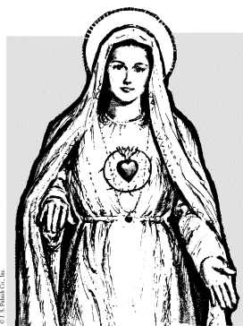
Immaculate Heart of Mary

We are starting the first Saturday devotions to Our Blessed Mother on the first Saturday of November. It will take place immediately after the 9 am Mass on November 4, 2017, December 2, 2017, January 6, 2108, February 3, 2018 and March 3, 2018. On November 4 the devotion will take place in our convent chapel due to a scheduling conflict.