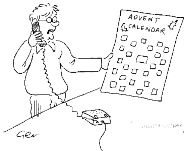
"Microsoft support? My windows won't open!"