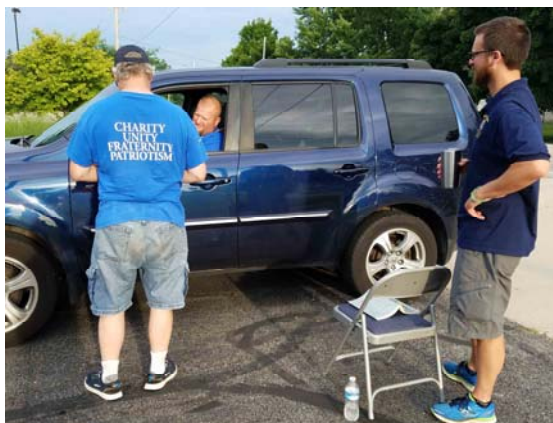
Brothers Peck (l.) and Schilling collected parking fees—a hot lonely job!