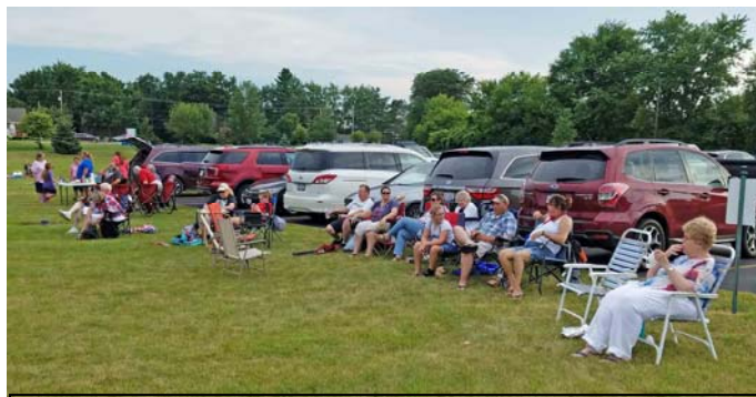
The early crowd had a 3-hour wait for the fireworks show.