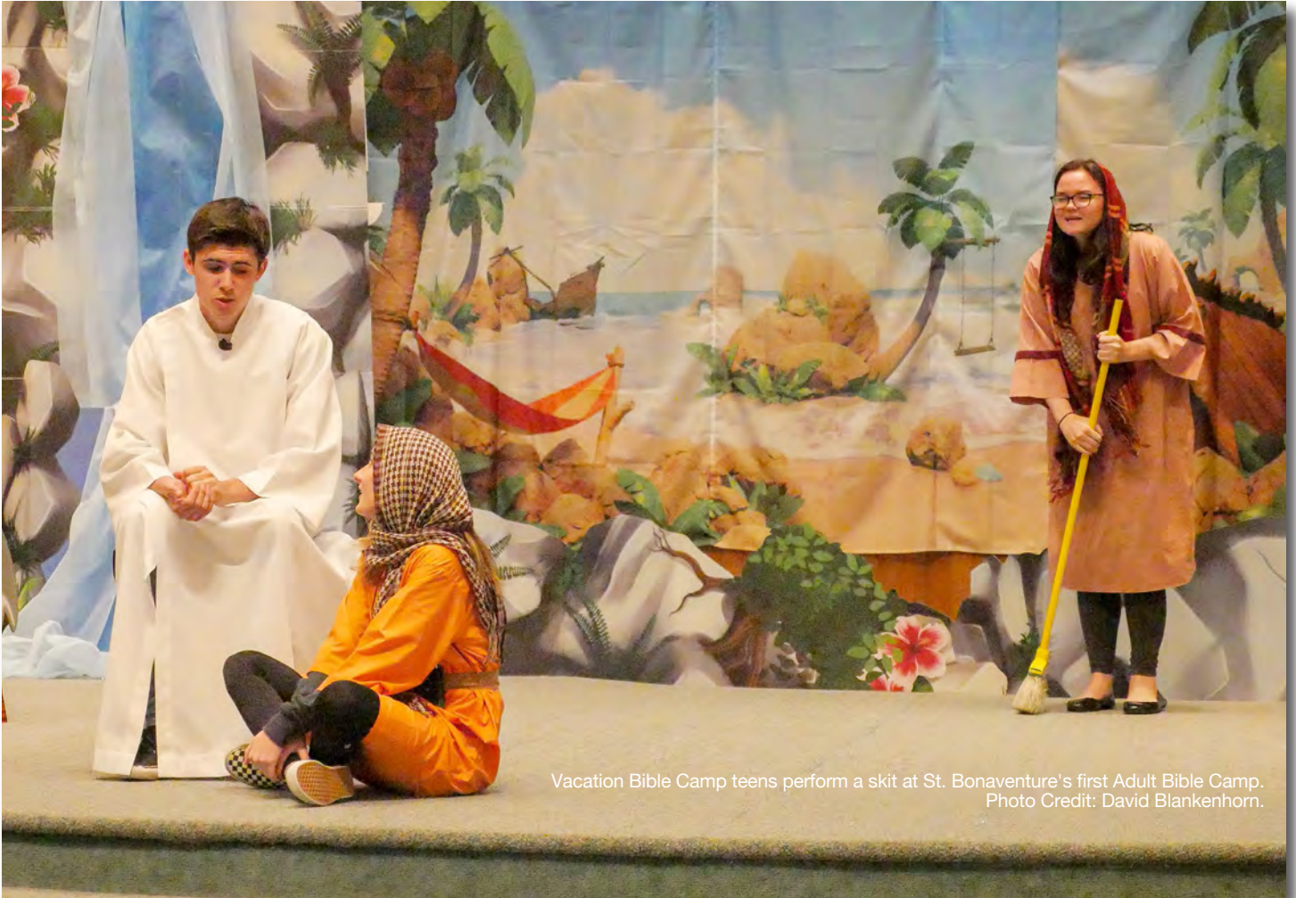
Vacation Bible Camp teens perform a skit at St. Bonaventure's first Adult Bible Camp.

5562 Clayton Road, Concord, CA 94521 • PHONE (925) 672-5800 • FAX (925) 672-4606 • www.stbonaventure.net