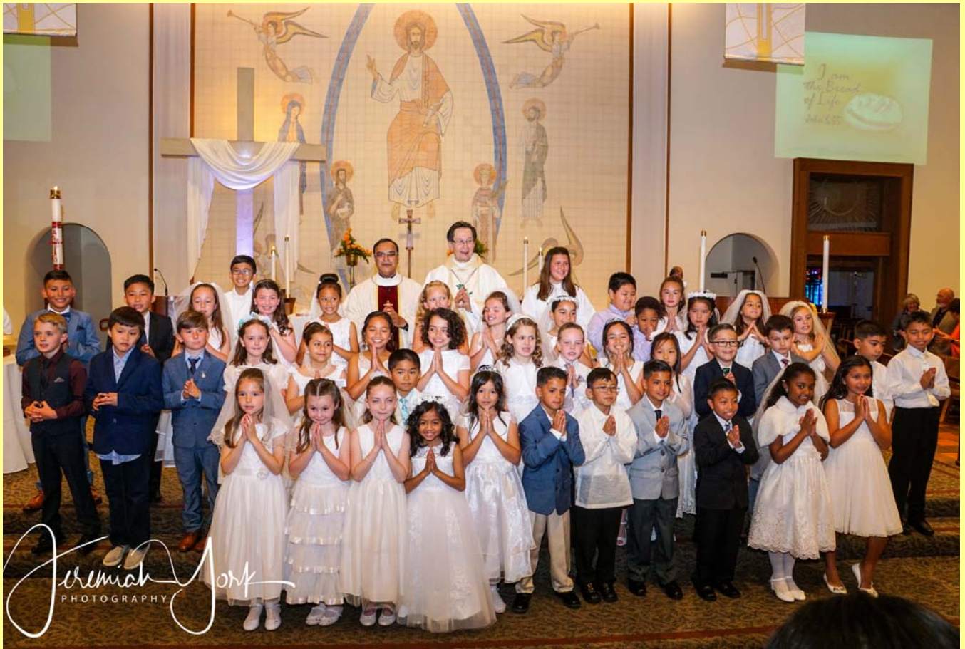
Our Faith Formation and School 2nd Graders made their First Holy Communion on Saturday, May 5th. May they be nourished with the body and blood of Christ throughout their lives.