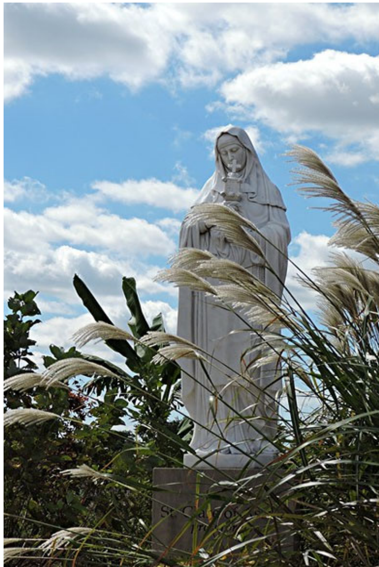
St. Clare of Assisi, Pray for Us!