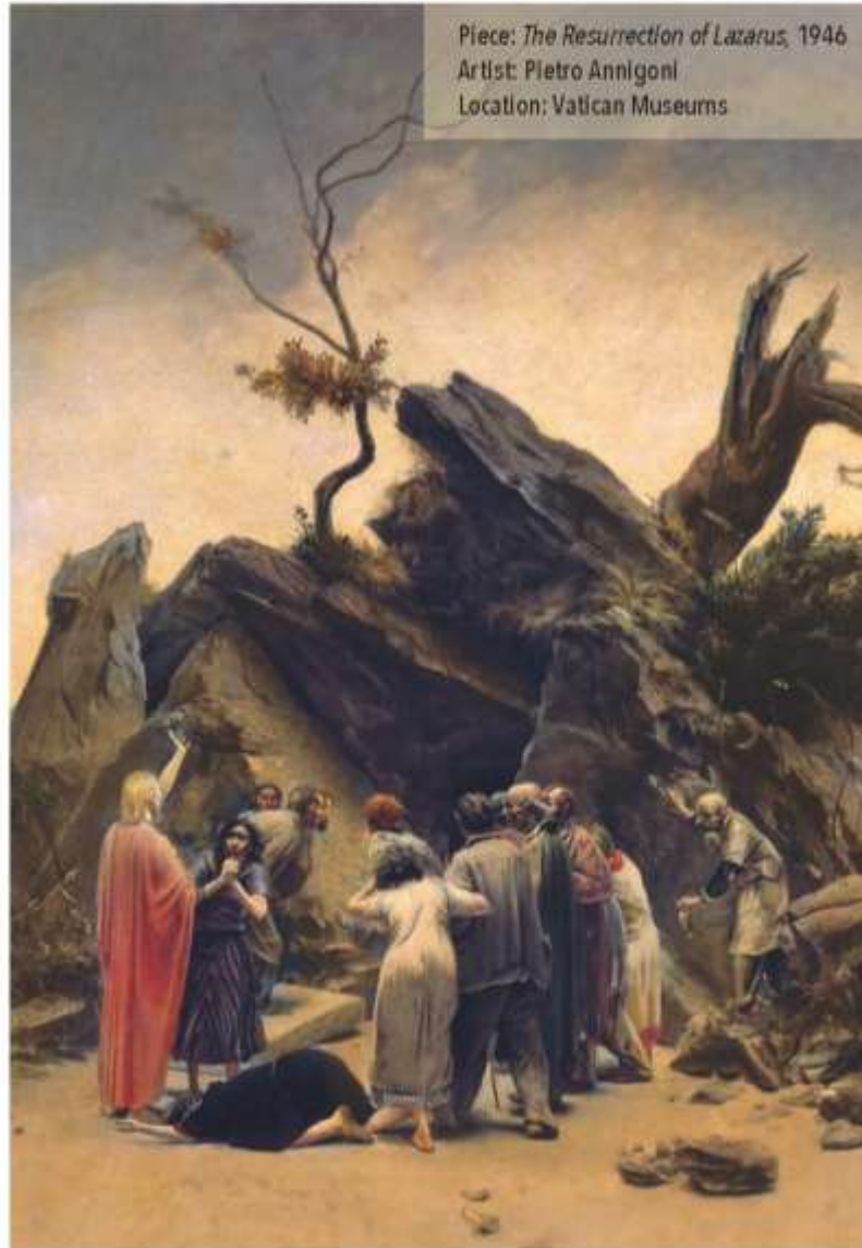
Piece: The Resurrection of Lazarus , 1946 Artist: Pietro Annigoni Location: Vatican Museums