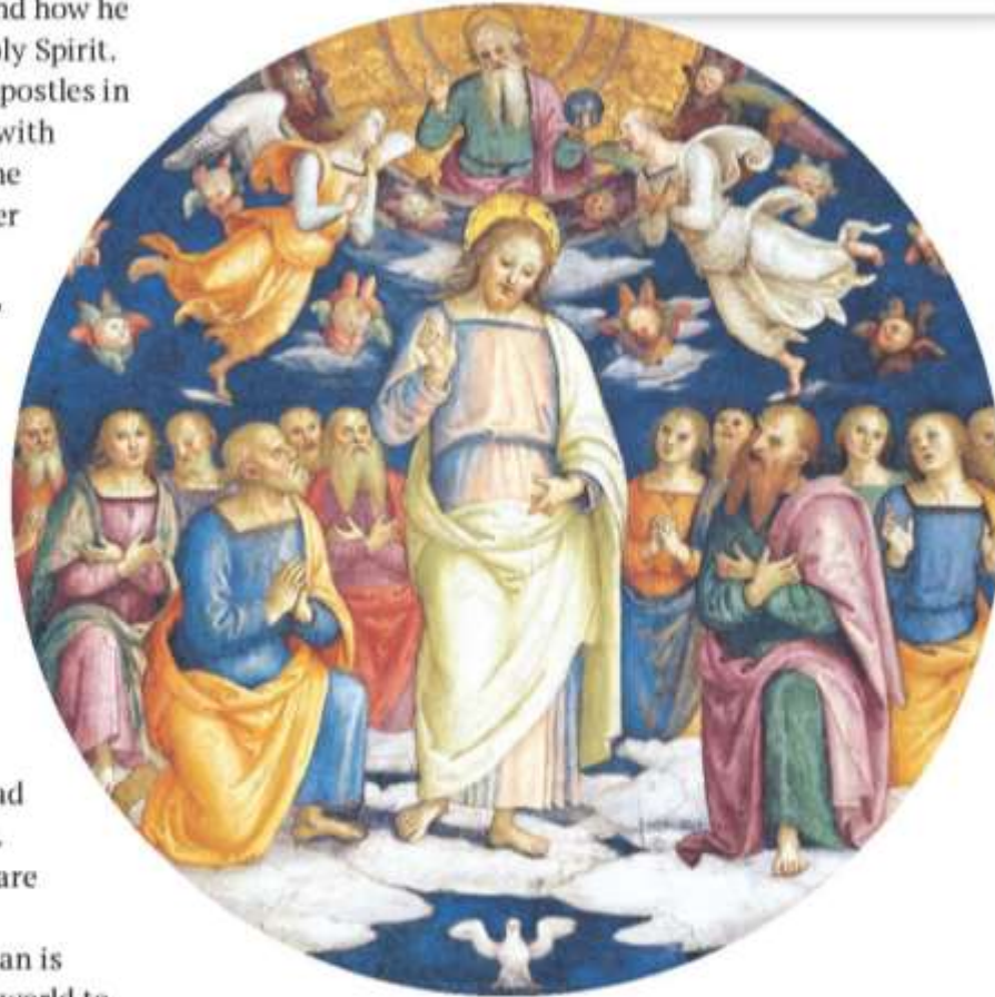
Piece: The Holy Trinity and the Apostles , 1507-1508 Artist: Pietro Perugino Location: Vatican Museums