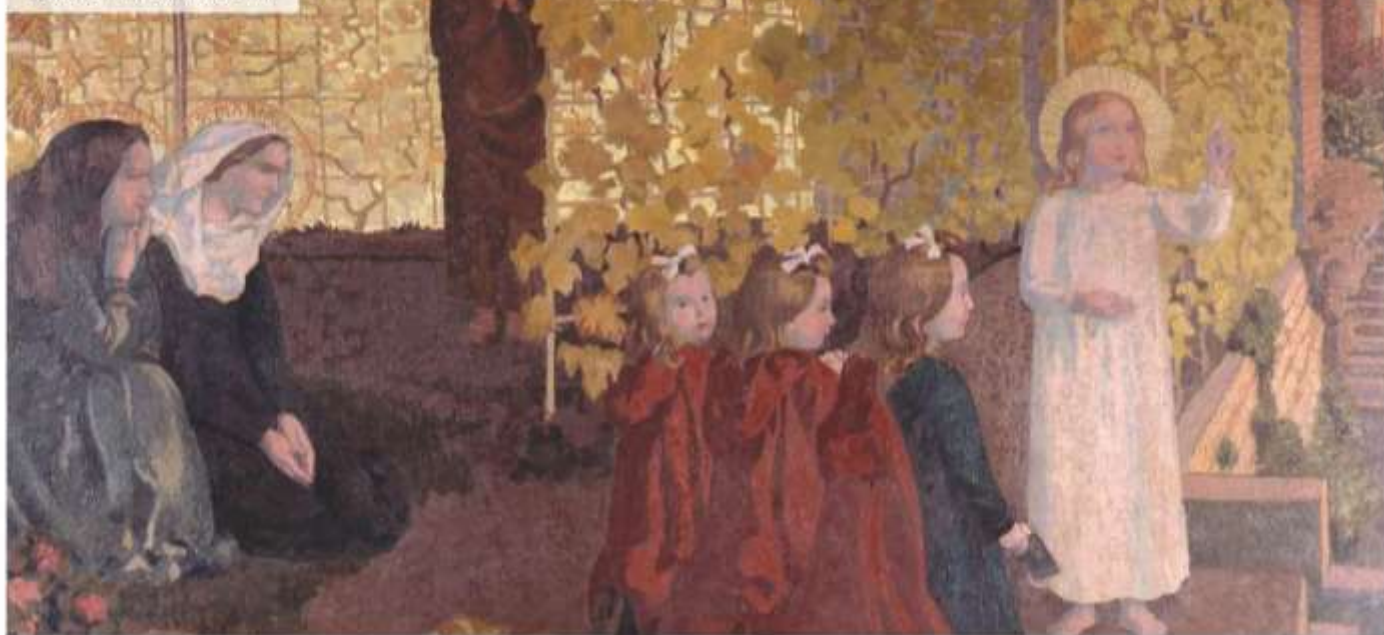
Piece: Nazareth , 1905 Artist: Maurice Denis Location: Vatican Museums

Is he not the carpenter, the son of Mary? ...He was amazed at their lack of faith.