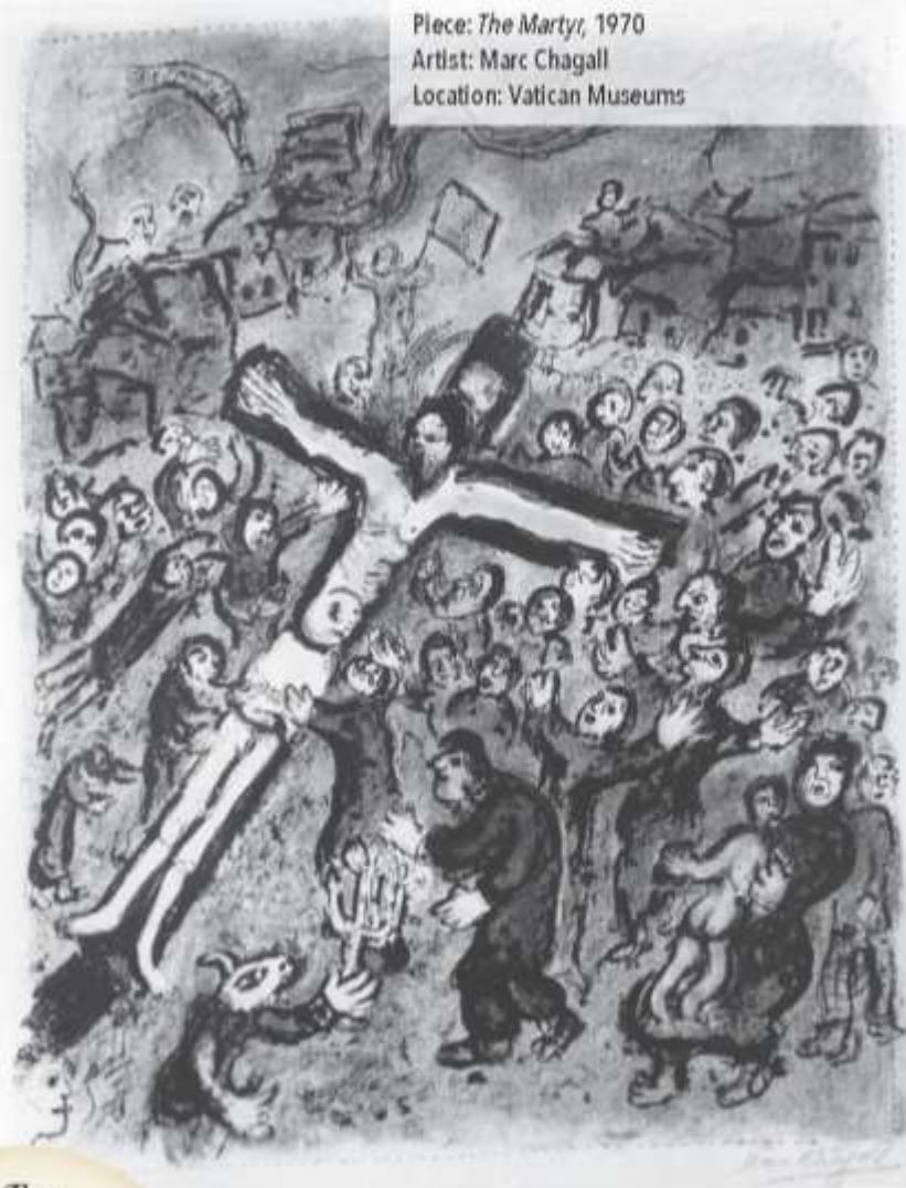
Piece: The Martyr , 1970 Artist: Marc Chagall Location: Vatican Museums

In the Eucharist, Jesus comes down to you today to carry your