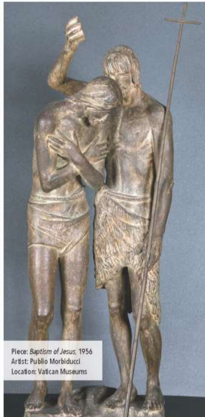
Piece: Baptism of Jesus, 1956 Artist: Publio Morbiducci Location: Vatican Museums

Am I courageous enough to ask the Holy Spirit to come down and touch my soul with his fire?