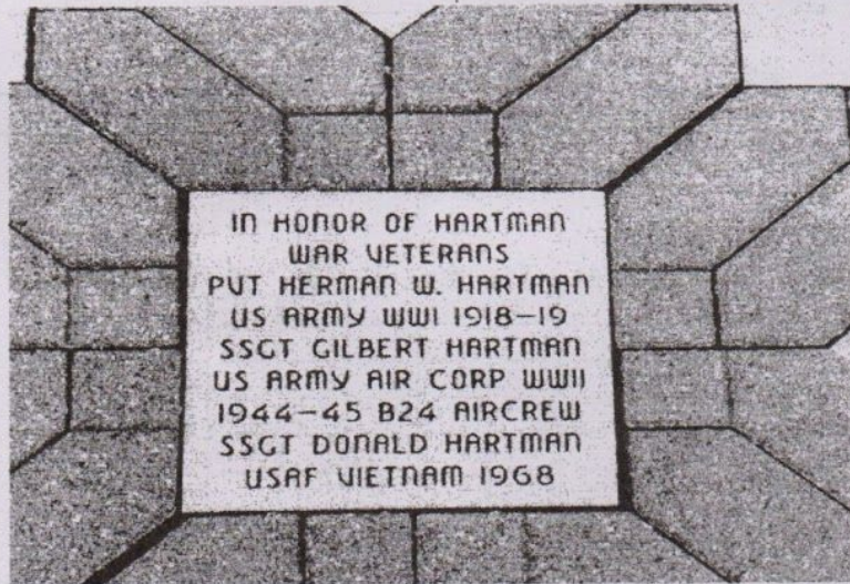
Example of Paver not exact color but correct size of 12" by 12" square

Use the form on the rear for your inscription.